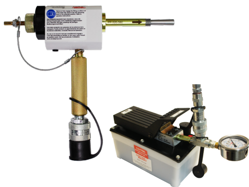
Small Ram Kit (PAP-6600)